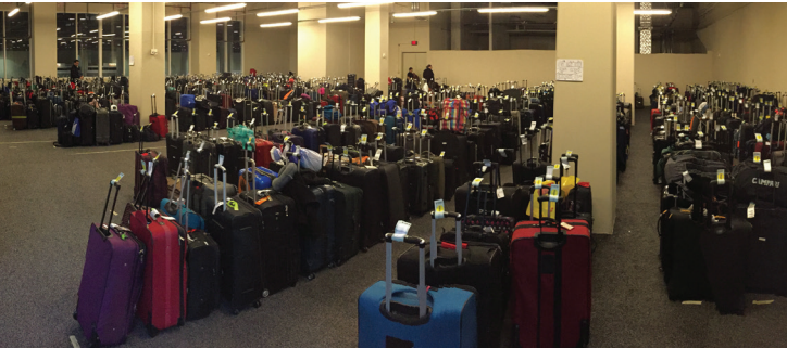
Above: The luggage room at a conference, where the Bags team begins the process of screening, tagging and securing luggage before delivering it safely to the airport.